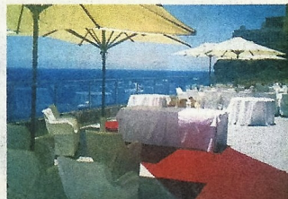
Amadores Main restaurant terrace with stunning views out to sea